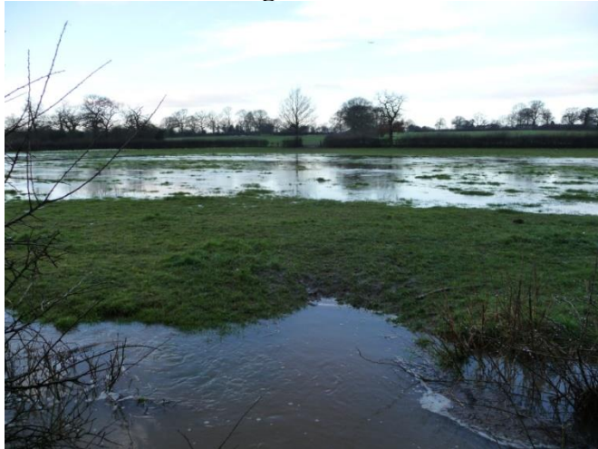
More flooding at Barratt's Farm